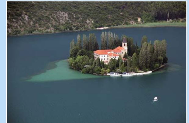
Island of Visovac in Krka National Park