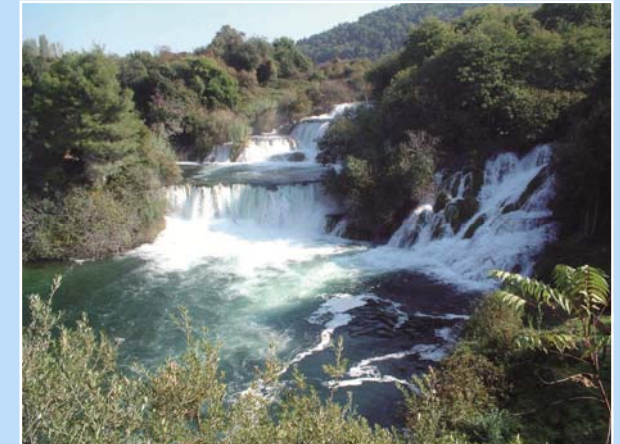
Skradinski Buk (Krka Waterfalls) featured in Krka National Park

Participants and accompanying persons of MOTSP 2012 have a special offer from the Hotel Kolovare. For reservation and more information, please contact: motsp2012.org .